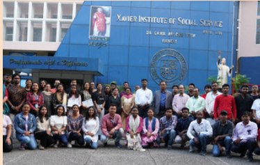
Inaugural-cum-Valedictory Ceremony of Geoinformatics (GIS) Training Programme.