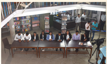
Students participating in the New India Debate organized by SANSAD TV.

XISS students participated in the New India Debate on Sustainable Development Goals (SDGs) organised by SANSAD TV. The nation has set these goals to realize the dream of a better life. An ambitious initiative that aims to provide opportunities to all sections of society to lead a dignified life by eliminating the gap of poverty, unemployment, illiteracy and gender inequality from the country by the year 2030.