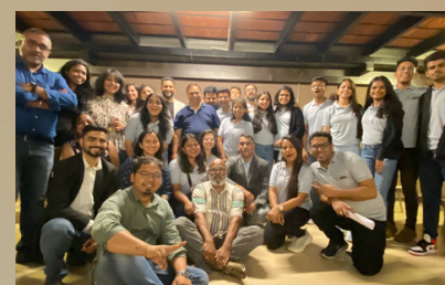
Students during the AAXISS Alumni Meet in Bengaluru.