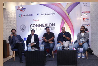
Panel discussion during the AAXISS Alumni Meet in Delhi.