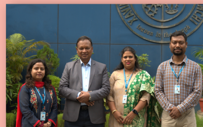
XISS Bulletin Team