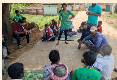
Students of Rural Management Programme during their Rural Camp stay.