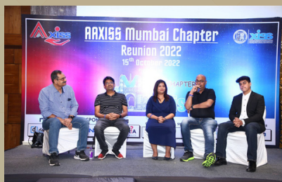
Panel discussion during the AAXISS Alumni Meet in Mumbai.