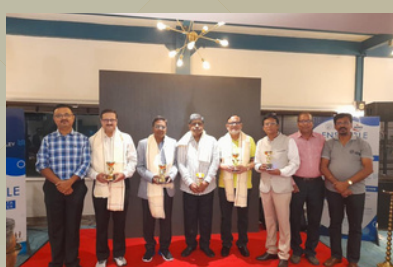
Dignitaries felicitated during the AAXISS Alumni Meet in Kolkata.