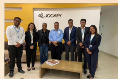
Industrial Visit of students of HRM Programme Batch 2021-23.

Industrial tour/visit is an integral part of the XISS Course Curriculum and is student-driven activity. To groom the final year students as a partner of growth & development, the Human Resource Management (HRM) Programme of XISS organised Industrial Tour for the students of batch 2021-23 from 12-21 October 2022. The purpose of the tour is to accustom students to Industry Interface, Team Participation and Leadership Skills, Knowledge Development, Alumni Relations, and Marketing of HR Talents. This year a total of 66 students from the HRM II batch of 2021-23 went to Kolkata, Mumbai, Bangalore, and Delhi for their industrial tour. The companies covered during the tours were a healthy mix of Manufacturing, Automobiles, FMCG and Food Processing, Food & Beverage, Healthcare and Hospitality Sectors, PSUs like Coal India, Power Grid, Aviation, e-Commerce, Marketing and Advertising, Banking, and Fin-Tech, and Group Holding Companies.